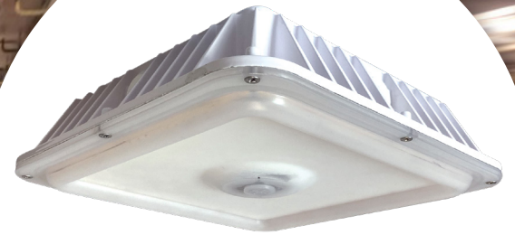
GL80 LED Square Garage Light

Promote safe driving. Deter theft. Lower operating costs.