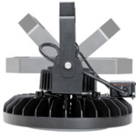
HBSAM20 (Shown attached to High Bay)