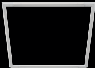
VLFT2 - 2' x 2'