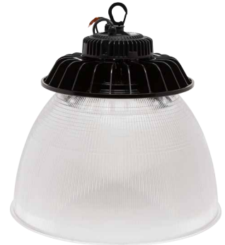
Diffuser attached to Round High Bay