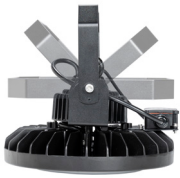
HBSAM20 (Shown attached to High Bay)